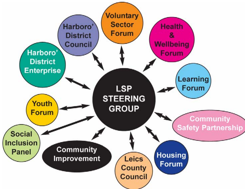
Figure 2 – Forums comprising the Harborough Local Strategic Partnership

5.15 An update of progress on the Local Development Framework will be submitted on a regular basis to the forums. Where appropriate, Planning Officers will also attend the meeting.