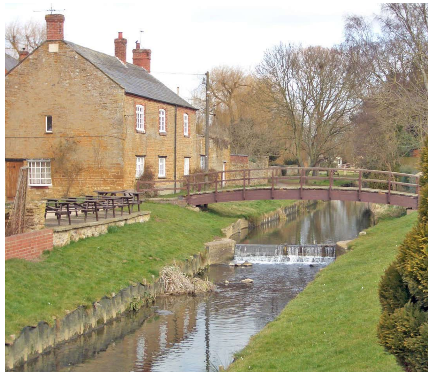
The Medbourne Brook flowing through Medbourne Village

There are a range of smaller settlements in the Welland Valley some of which have retained their traditional features such as Medbourne to the north east located along the Medbourne Brook. Many of the other villages in the region have been dissected by the busy through route of the A4304; their character tends to be affected by the through traffic of vehicles.