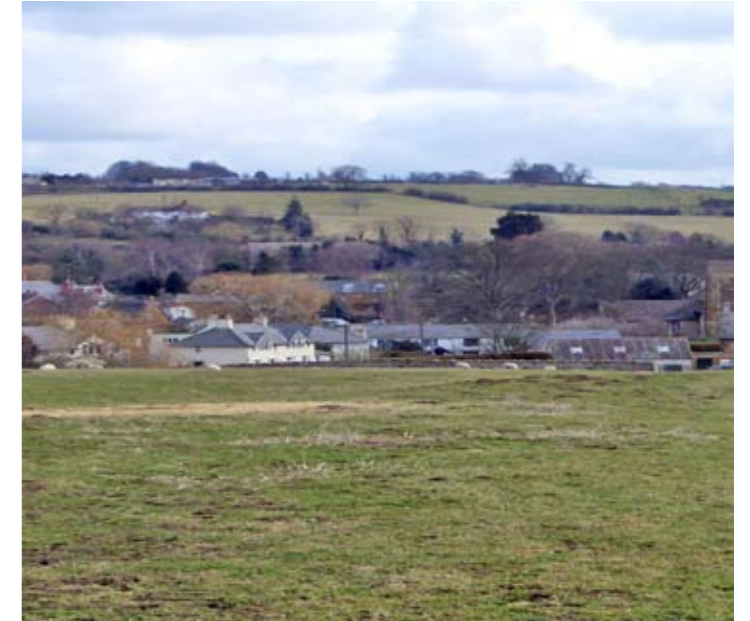
Looking east from Paynes Lane across Medbourne village