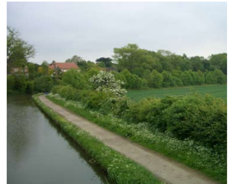
Grand Union Canal on western border of Market Harborough