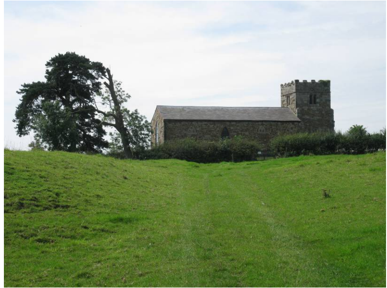
Gartree Road, looking south west at Church of St Giles and deserted Medieval Village of Stretton Magna