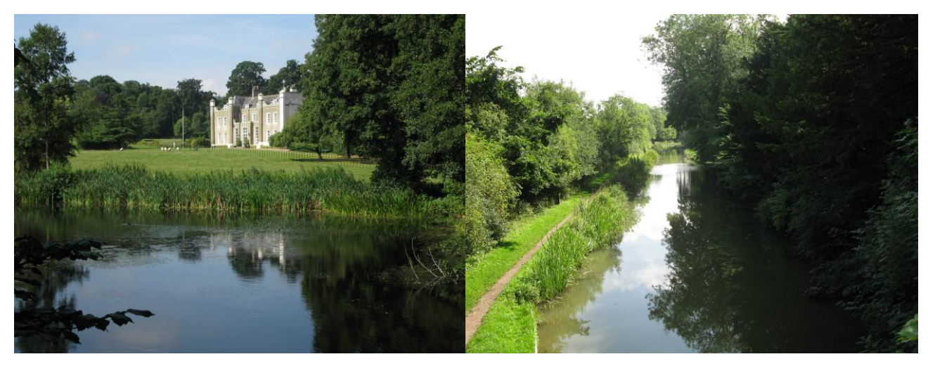
From Wistow Road, looking south west at Wistow Hall