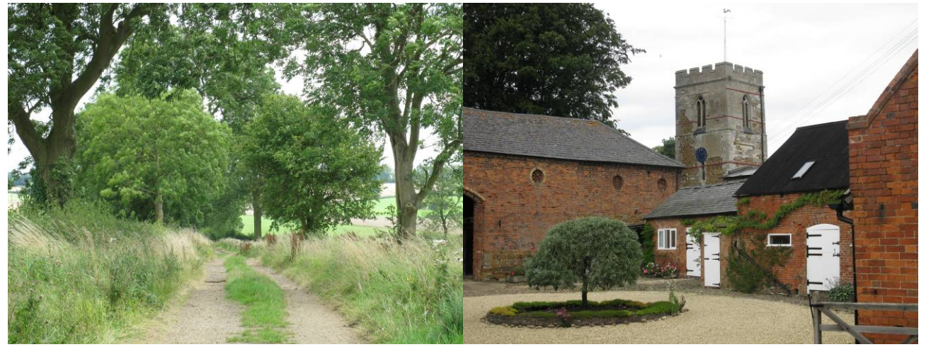
From Gartree Road, south east of Little Stretton, looking along route of Roman Road (now byway)