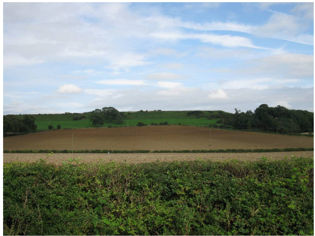
From Coplow Lane, north of Billesden, looking east