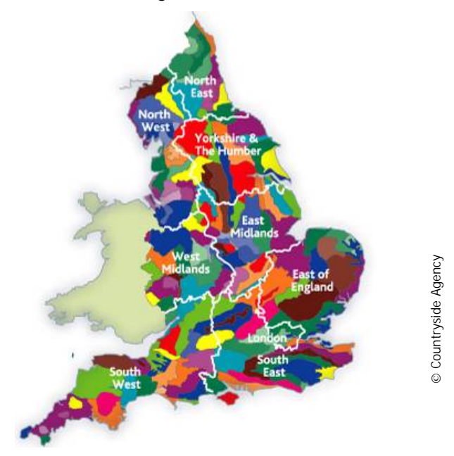
Figure 1 – Countryside Character Areas – National Picture