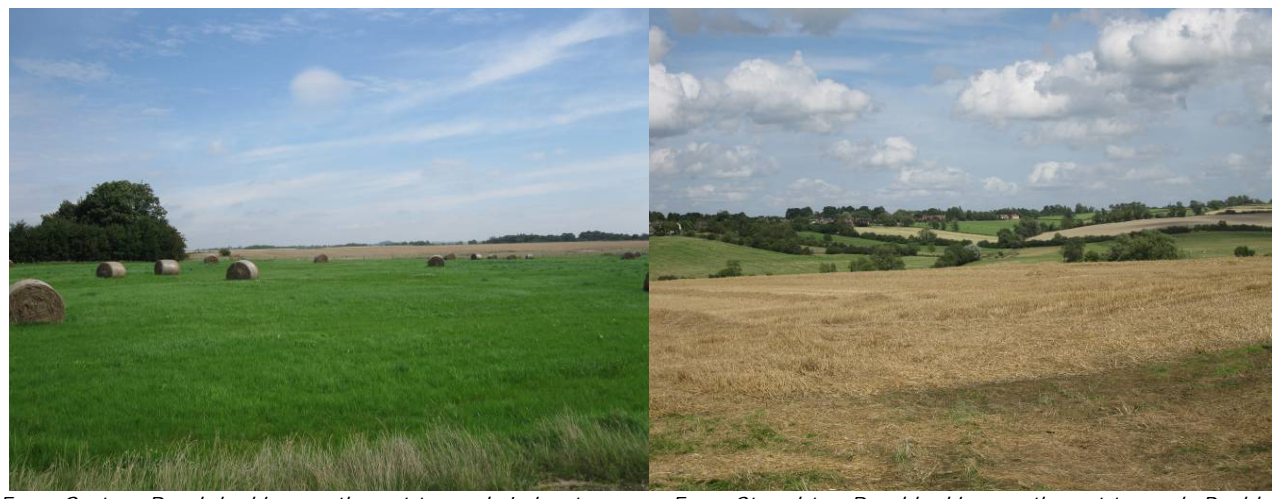
From Gartree Road, looking north east towards Leicester Airport