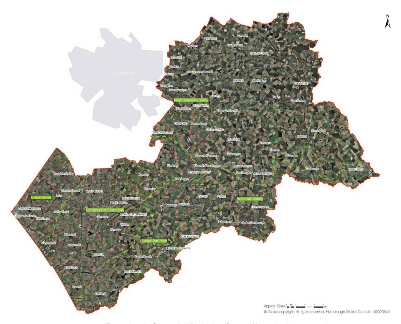
Figure 4 – Harborough District Landscape Character Assessment