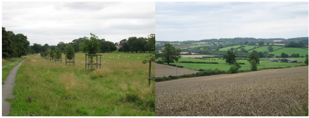
From minor road between Rolleston Hall and Skeffington, looking north east