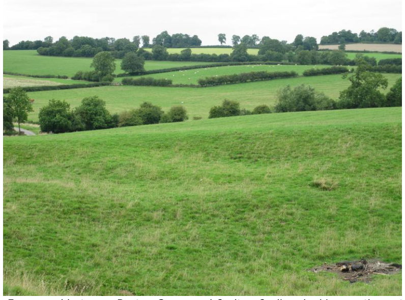
From road between Burton Overy and Carlton Curlieu, looking north west