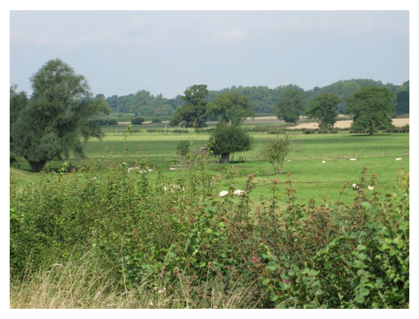
From Wistow Road, east of Wistow Hall, looking north west