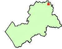
Inset Map: 32 (Owston)