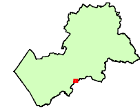
Inset Map: 42 ( Theddingworth )