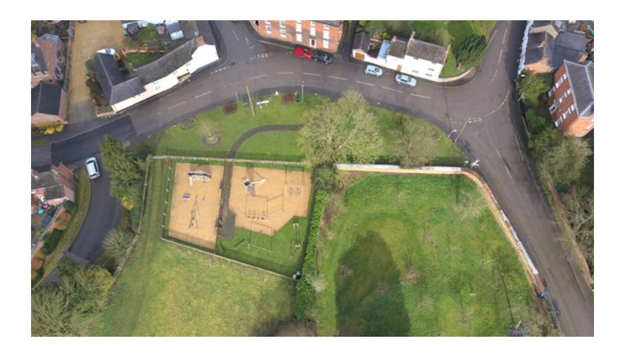
Local Green Spaces