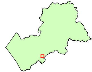
Inset Map: 56 ( Husbands Bosworth )