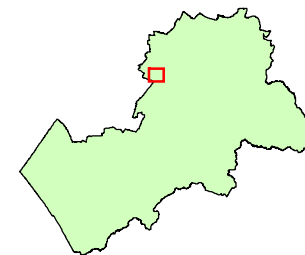
Inset Map: 70 (Leicester Airport)