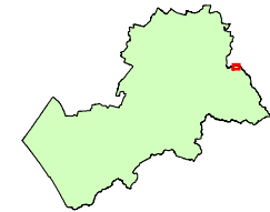
Inset Map: 1 (Allerton)