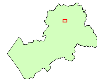
Inset Map: 50 (Billesdon)