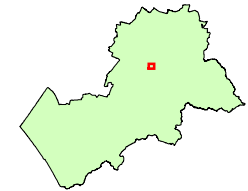
Inset Map: 20 (Ilston on the Hill)