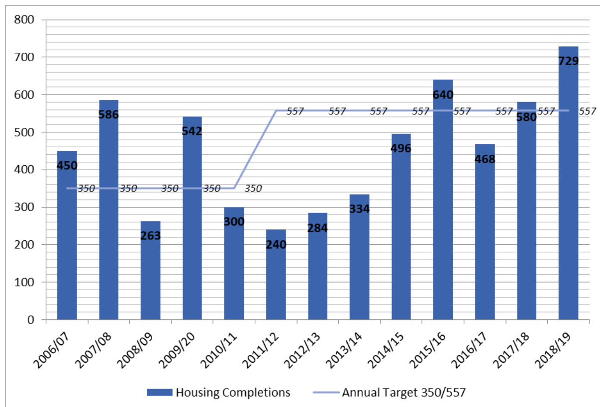
Figure 1: Annual housing completions in Harborough District from 2006/07 to 2018/19