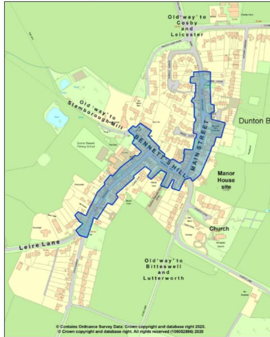
Figure 11: Local built environment character area