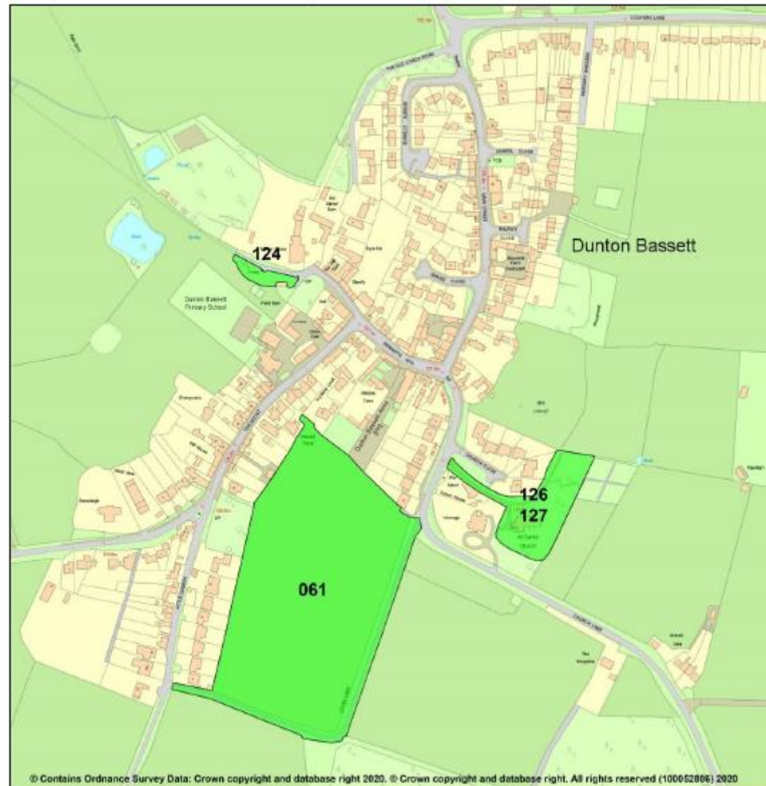
Figure 5: Local Green Spaces