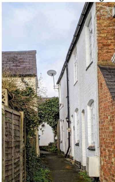
Narrow footpath showing the line of cottages.