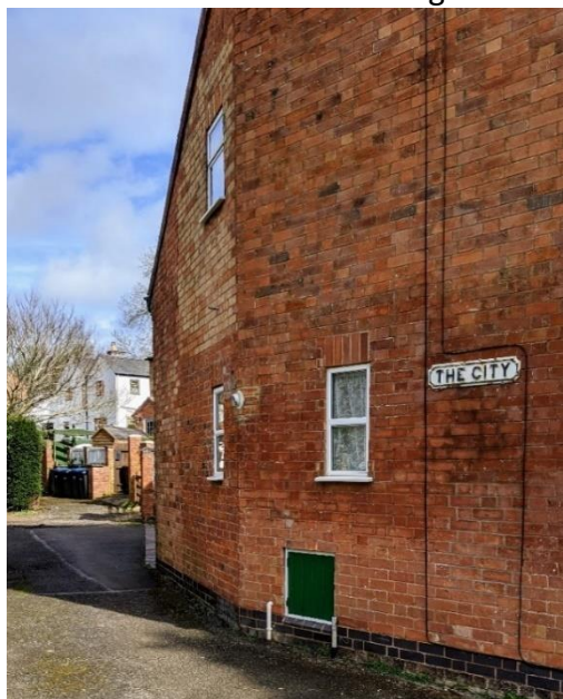
Entrance to The City off Albert Street.

The origin of this unadopted street name is unknown, but the area was built originally outside the village limits and housed the poorest members of the village. It was described by local historian, F.P. Woodford, in the early 20 th century, as 'three mud thatched cottages and three small brick and thatched cottages as well as other houses'.