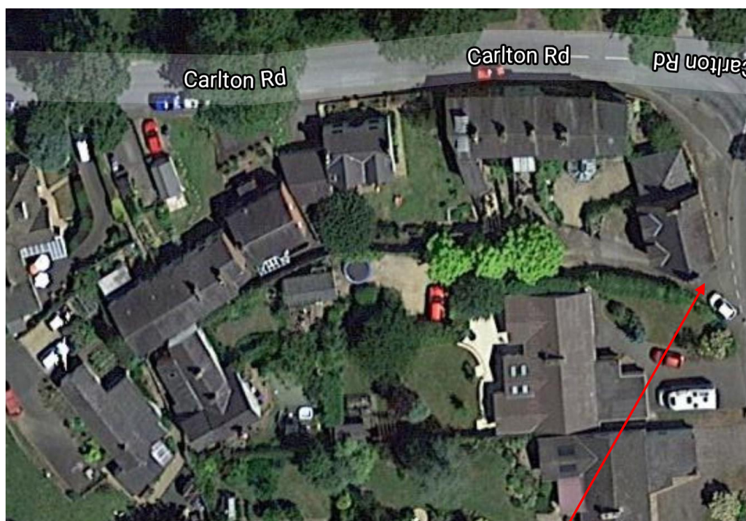
An aerial view of the cottages of The City using Google Earth . It runs parallel to and west of Carlton Road. The entrance off Albert Street can be seen just by the white car.