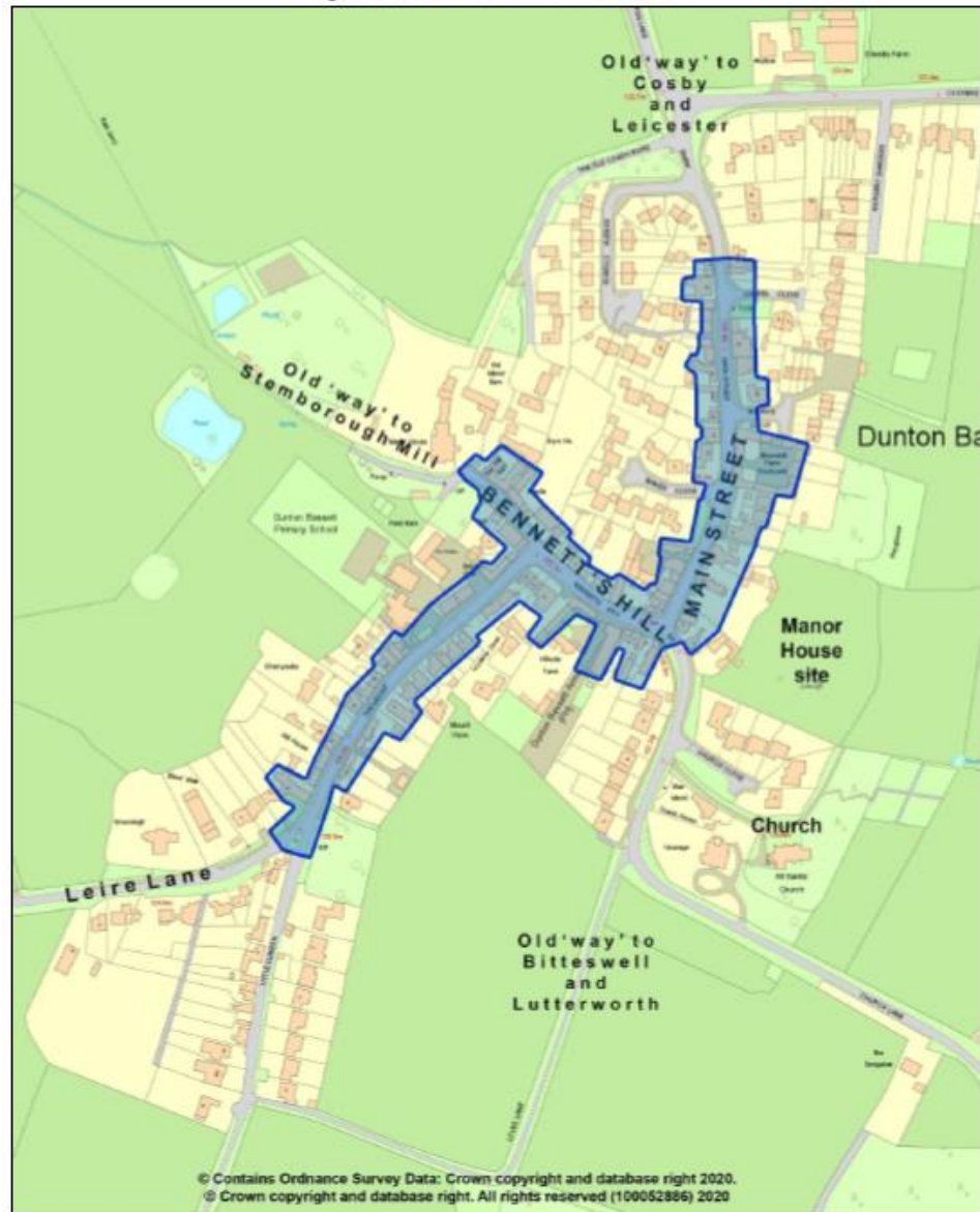
Figure 11: Local built environment character area