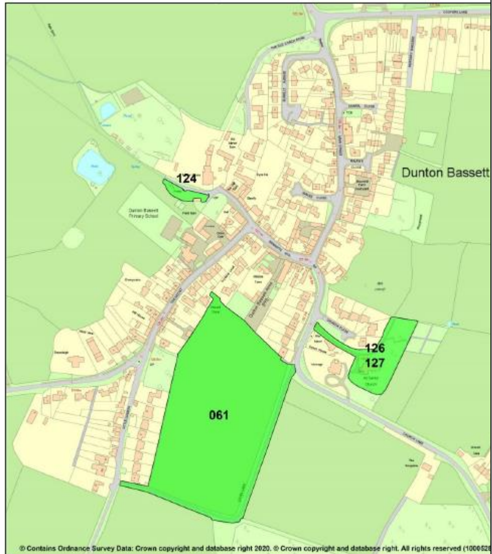
Figure 5: Local Green Spaces