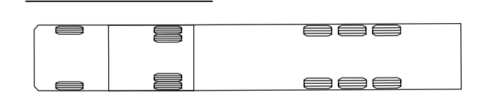
HGV Plan View:

FTA Design Articulated Vehicle (1998) Overall Length 16.480m Overall Width 2.550m Overall Body Height 3.870m Min Body Ground Clearance 0.515m Max Track Width 2.470m Lock to lock Time 3.00s Kerb to Kerb Turning Radius 6.550m