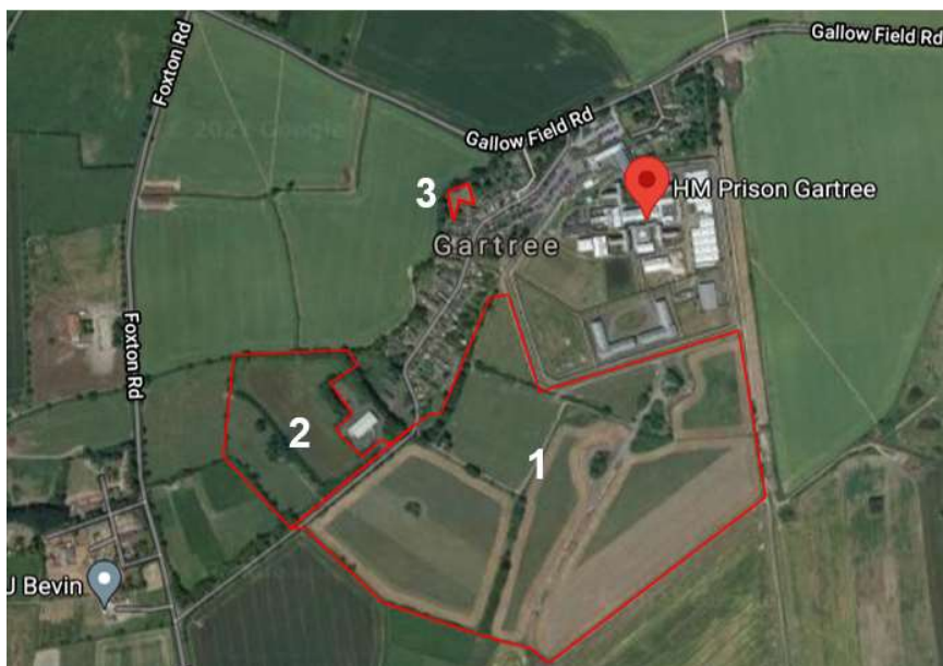
Figure 2 – Land Parcels