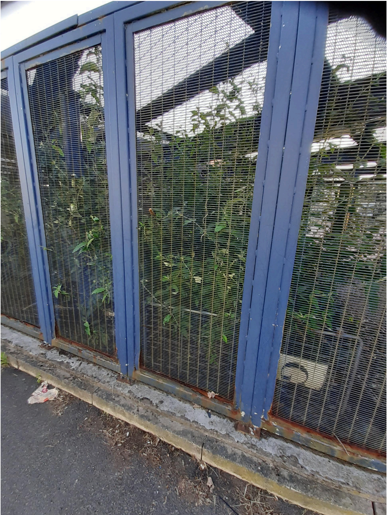
HMP Gartree, 30 June 2021. The cycle shed is clearly not in frequent use