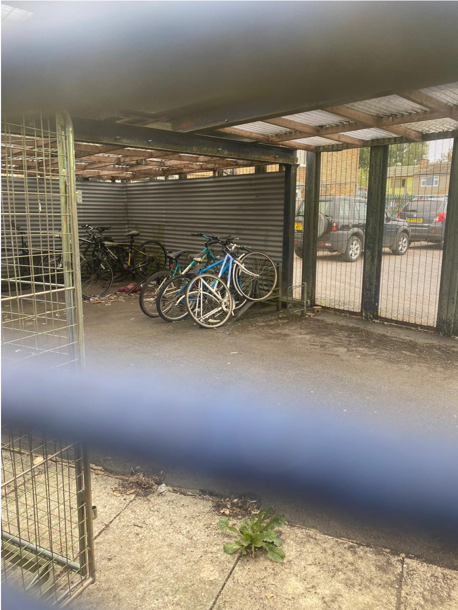
24 August 2022

This scene remained static; this photograph shows 24 August.