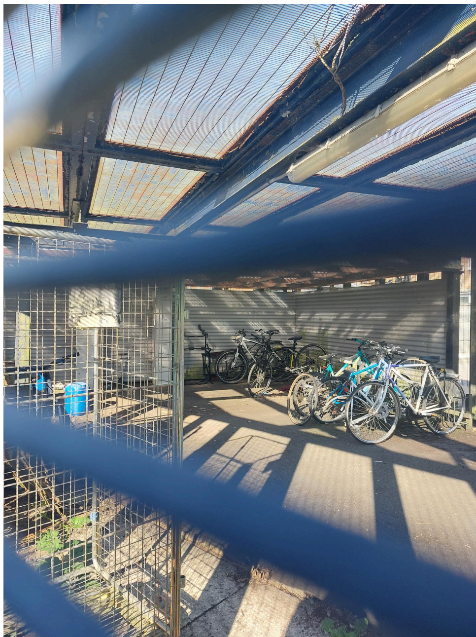
9 August 2022. A new bike in the shed and one abandoned bike being cannibalised.