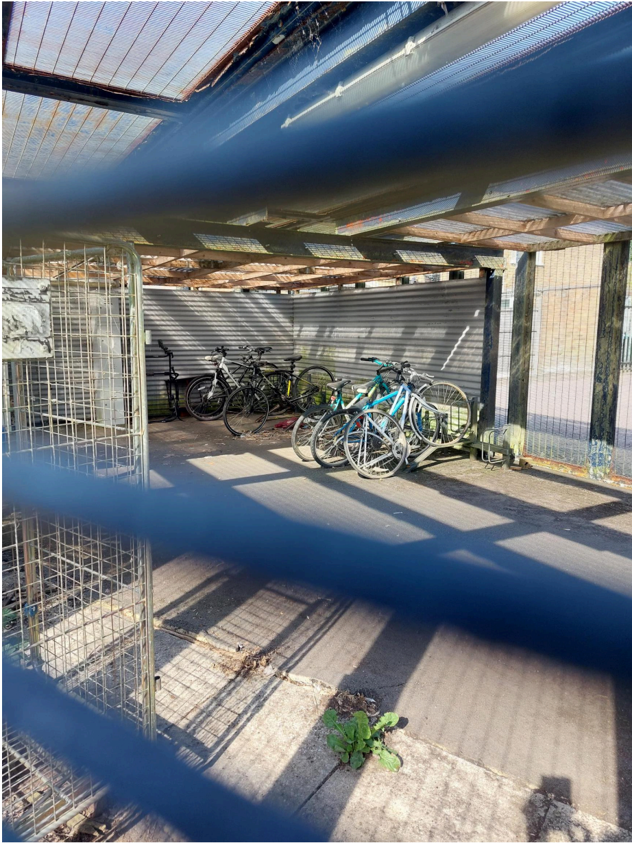
14 August 2022

By 14 August, two more abandoned bicycles had arrived.