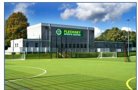
Sports centre and community hub