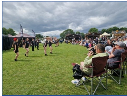
Community events are held here regularly