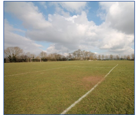
General view to northeast boundary