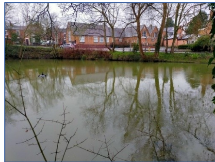
View over pond to xxxxxx